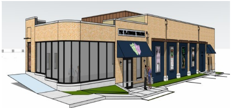
W. 3rd STREET